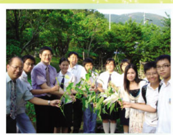
有機園圃 - 有機飲食分享