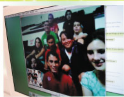
Video chat with Son Light Christian Center worship team, CA., USA