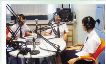
Presenting a Special Program on RTHK3SPKC Radio Station