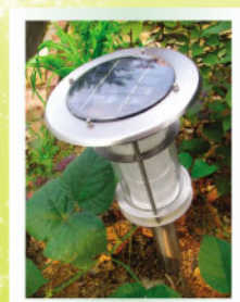
再生能源設施 - 太陽能庭園燈