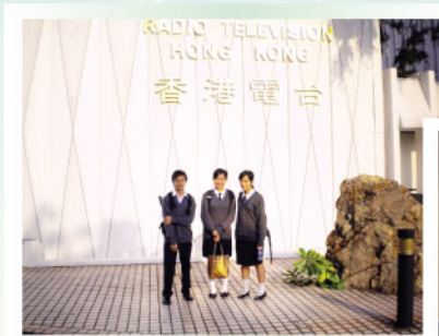
Presenting a Special Program on RTHK3

http://www.spkc.edu.hk/school_life/index.php?subsection=gallery&file=radio_gallery