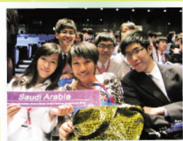
Attending HKMUN 2010 as delegates of Saudi Arabia

本校每年都積極與世界各地學校安排多次視像會議，給予同學與來自不同文化背景的朋輩真情交流的機會。過去三年裡，本校透過視像會議交流的國家已達十二個，我們曾合作的項目包括作曲、數碼故事創作、文化論壇及網上日誌分享。