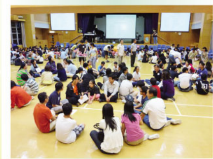
09-10第一次親子工作坊，將信仰融入家庭