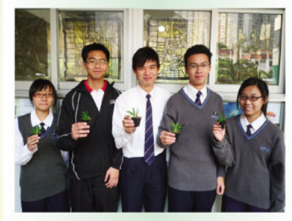
同學藉「一人一花計劃」培養環保意識

為配合新高中學制中之「其他學習經歷」，中四級的同学今年參與了一個名為「培基的祝福」的社會服務計劃，每月一次探訪鄰近廣源邨的獨居長者，為他們帶來溫暖與關懷。各同學須先修讀「認識長者課」以了解長者的需要並有關之溝通技巧。為配合不同的節期，同學都準備了不同特色的小禮物(如揮春及親手製作的曲奇餅)以表達心意。同學在探訪期間會了解長者的近況，並轉介有關機構作出跟進，以改善長者的生活環境。