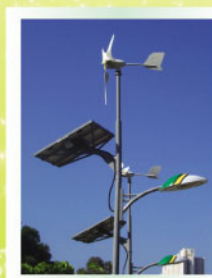
再生能源設施 - 風光互補街燈