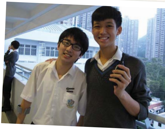
The Running Man working committee

This was the first event that we held last year. We got the idea from a Korean drama, which is aimed to arouse cooperative consciousness among schoolmates. As this was the first time for us to organize such a large function without related experience, we learnt the procedures through various attempts and made a little progress day by day. With all the devotion of our committee members, the event was held successfully and gained lots of support from schoolmates. We were also grateful to our teachers' assistance and they arranged the classrooms for venues and provided space for us to add spirit to our school life.