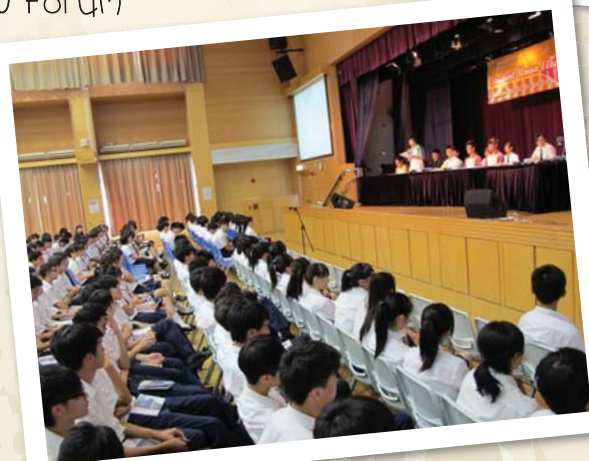
The SU Forum

We will continue to serve the whole school and every student whole-heartedly until the end of our term.