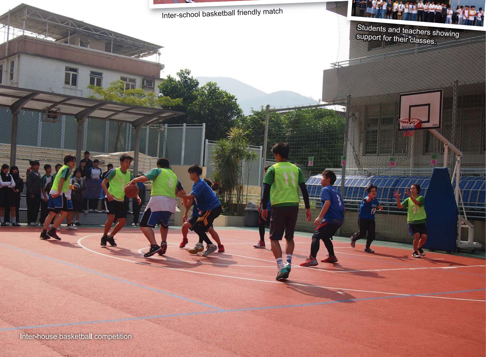
Inter-house basketball competition