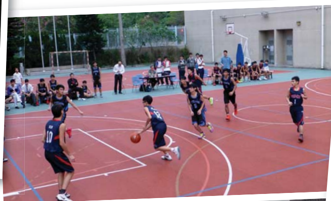
Inter-school basketball friendly match