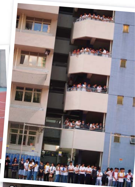
Students and teachers showing support for their classes.