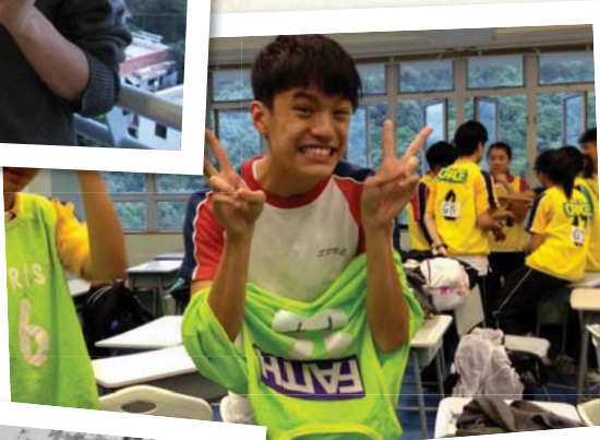
Get ready for the Running Man