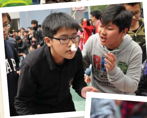
We are having fun in the game section!