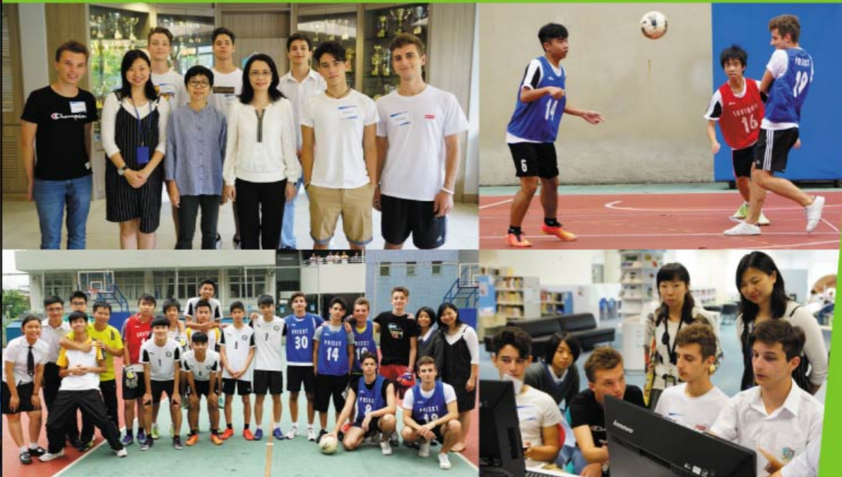
2017-05-05 AFS Exchange Students' school visit