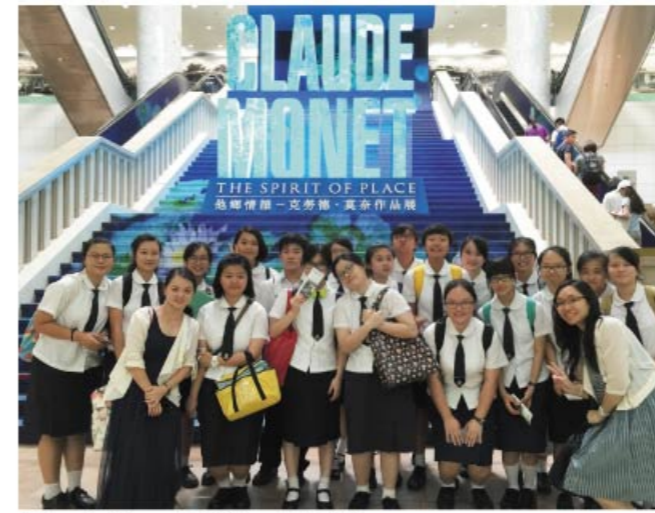
▲ Claude Monet Exhibition Visit 2016