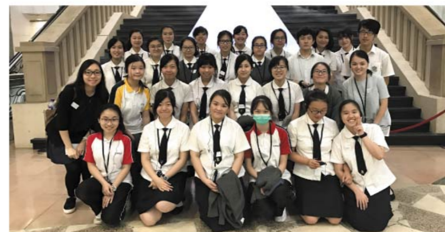
▲ Inventing Le Louvre Visit 2017