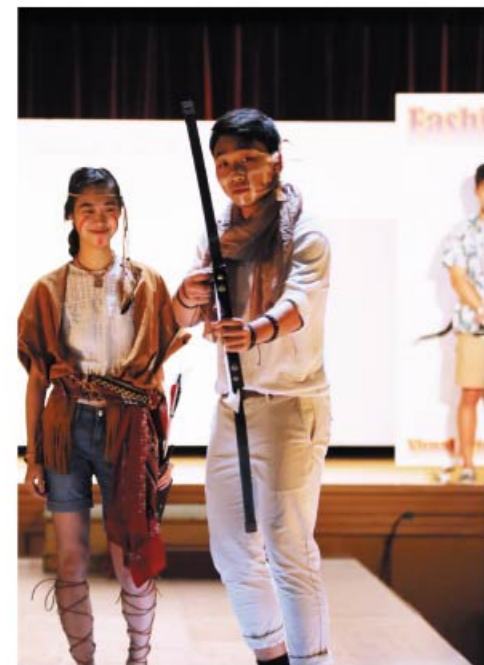
▲ Alumni Performance in Fashion Show 2016