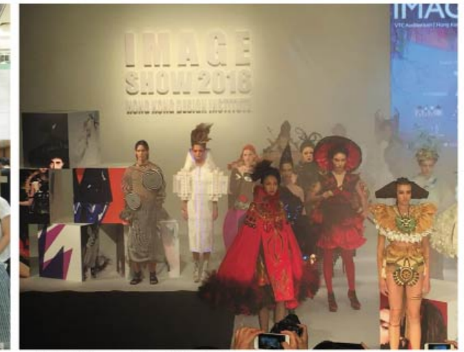
▲ HKDI Image Show Visit 2016