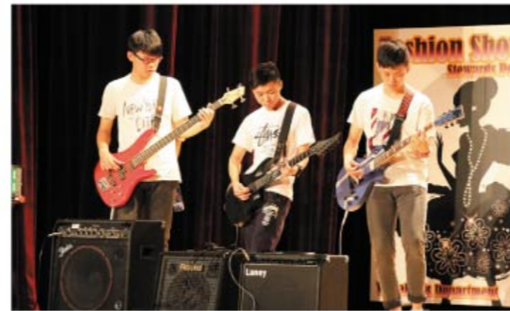
▲ The Fashion Show unveils the talent of the best emerging student designers.