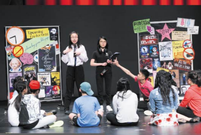
Backstage, the production crew spent time designing the look of the play, selecting costumes, making colourful props and sets and even makeup for the actors. The whole team learnt that putting together a play can be very challenging and there were problems that surfaced. However, their commitment and discipline paid off.

On the 28th of March 2017, the Drama Club performed for the 2nd time at the Association of English Secondary Schools Drama Festival at Shatin Tsung Tsin Secondary school. The results were pleasing with awards for Outstanding Performance and Outstanding Spoken English.