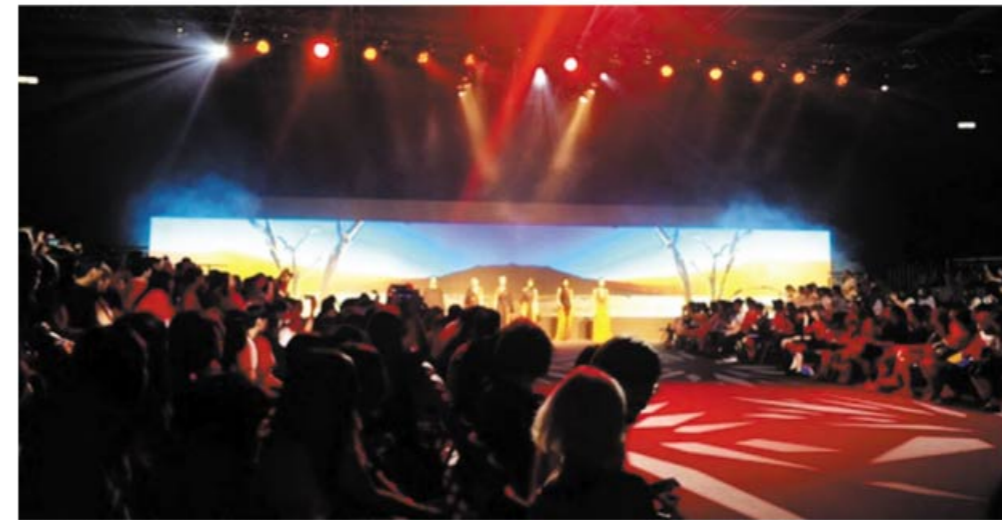
▲ PolyU Fashion Show Visit 2016