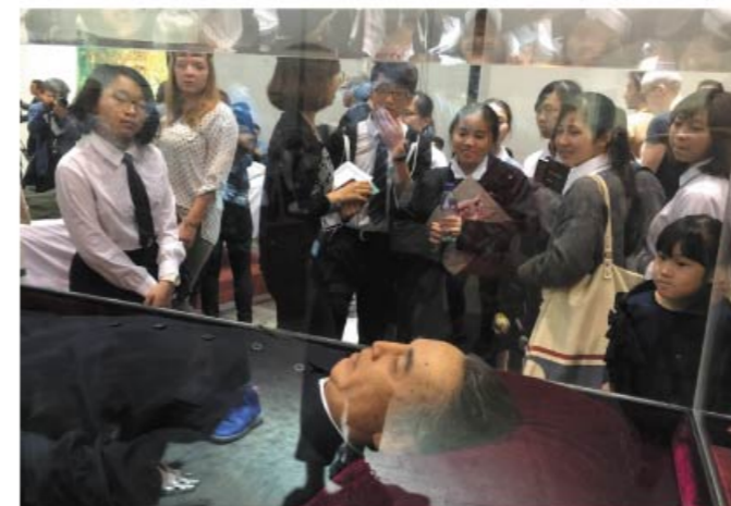
▲ Art Basel Visit 2017