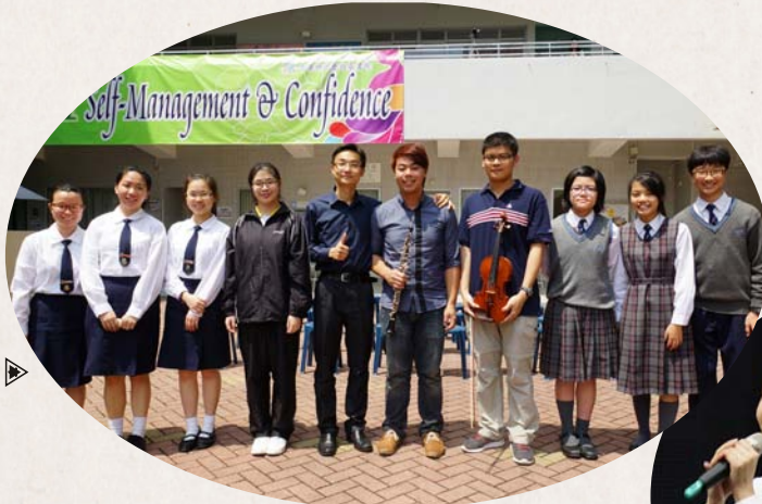
The Music Association 2015-16 ▶