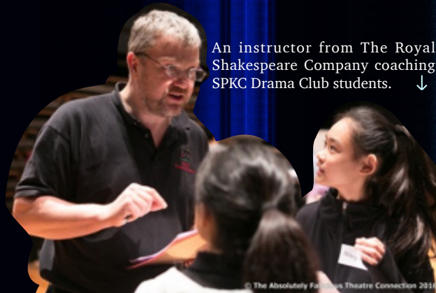
An instructor from The Royal Shakespeare Company coaching SPKC Drama Club students. ↓