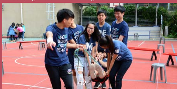
▼ Carrying a teammate through a series of obstacles.

On the second day, we played another game which required one student to be carried by others using ropes. Students experienced what it was like to be paralyzed and to be carried around by others. The idea of the game stems from the story of the paralyzed man in the Gospel of Luke. It was hoped that the game could teach students about the need for having companions in life.