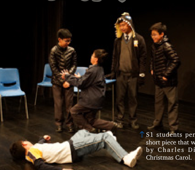
↑ S1 students performing a short piece that was inspired by Charles Dickens' A Christmas Carol.