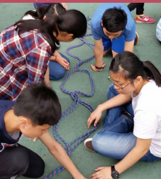
▼ Fixing ropes for their teammates to lay on.

On the second day, we played another game which required one student to be carried by others using ropes. Students experienced what it was like to be paralyzed and to be carried around by others. The idea of the game stems from the story of the paralyzed man in the Gospel of Luke. It was hoped that the game could teach students about the need for having companions in life.