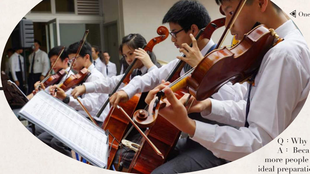
◀ One of the Music team-String performing