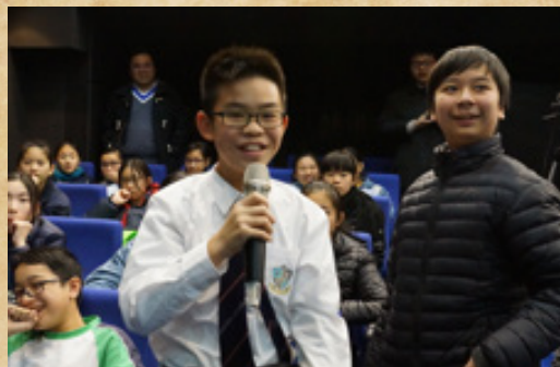
In the section of “Class Participation”, students answered the questions actively and enthusiastically.