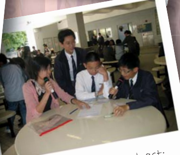
Whole school broadcast: Appreciation