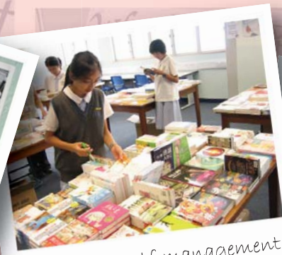
Book fair: self-management programme