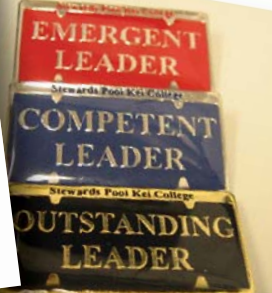
Badges for student award scheme