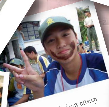
S3 Training camp