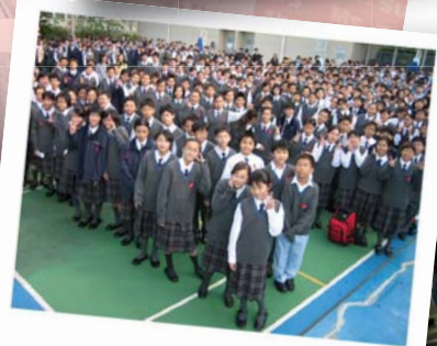
World AIDS Day (1 Dec 2006)