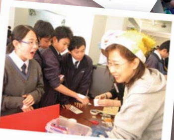
Lunch time activity (against drug abuse)